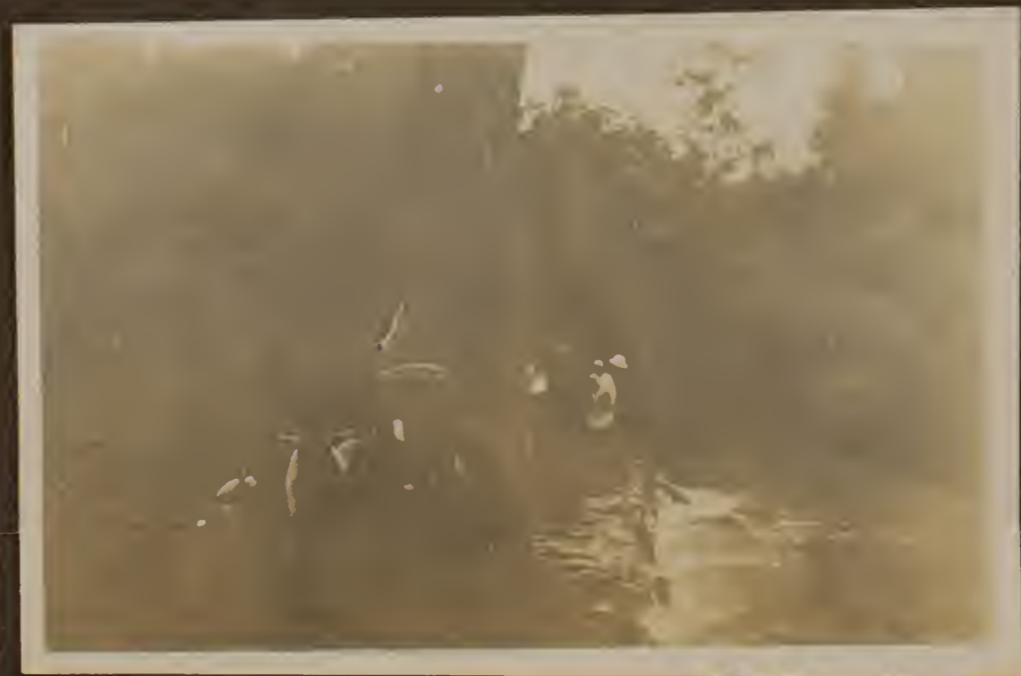
Far on River